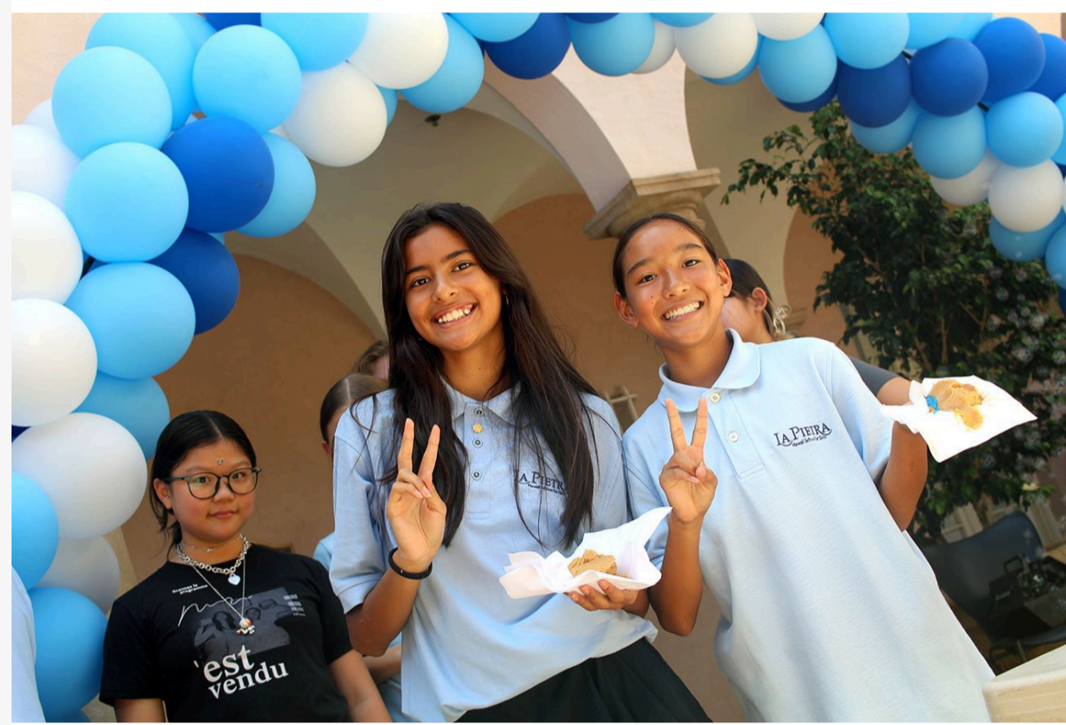
Students enjoy Coco Puff cake from Lūha Bakery as part of the day's birthday festivities.

As we embark on the next chapter of our journey, we are filled with optimism and excitement. The future holds limitless possibilities, and we are committed to ensuring that La Pietra remains a beacon of excellence and empowerment for generations to come.