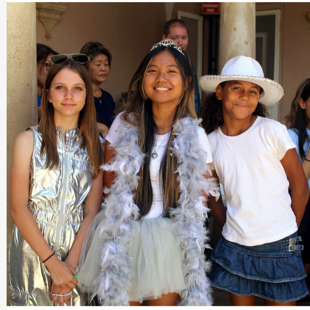
Students in their sparkly birthday gear – ready for this afternoon's karaoke party!

But today is not just about looking back. It's also about looking forward. Our school continues to evolve, innovate, and inspire the next generation of women leaders. The world is changing rapidly, and so are we—embracing new challenges and opportunities with the same spirit of courage and curiosity that has always defined La Pietra.